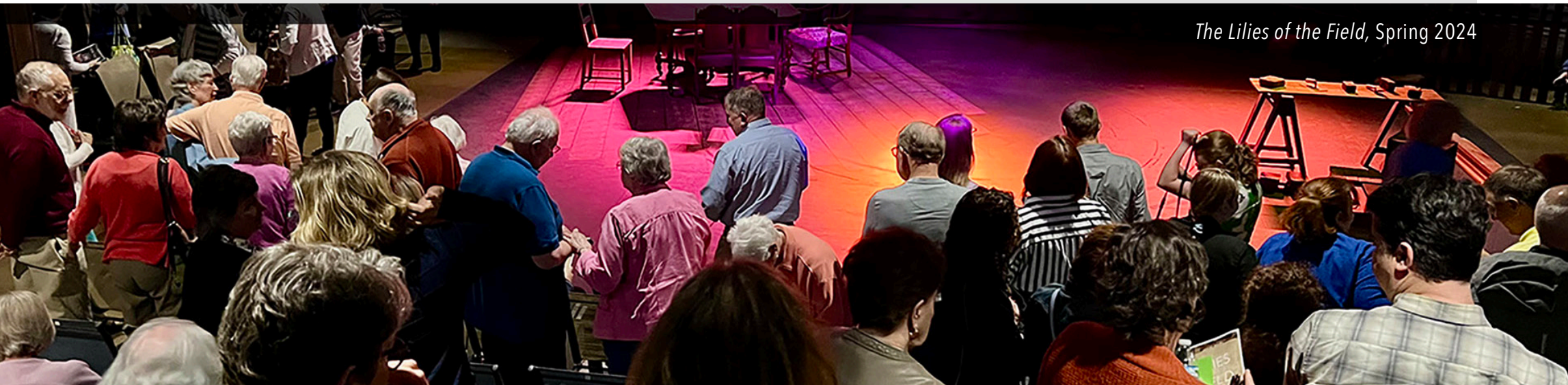
The Lilies of the Field, Spring 2024

Our email list reaches 7,000+ people, our mailing list currently reaches 10,000 households, and we have an engaged social media following of nearly 7,000 between Facebook & Instagram.