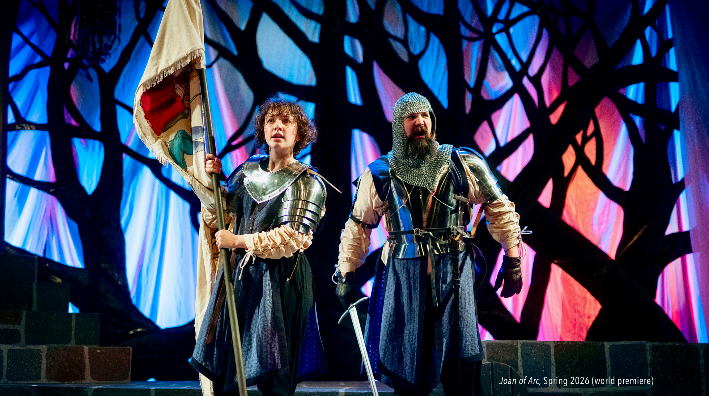
Joan of Arc, Spring 2026 (world premiere)