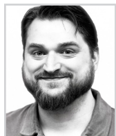
Thaxton Gamache Ensemble/Servants