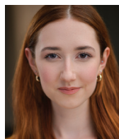
Rae Wasson Witch - 1 track'