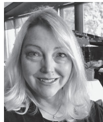
Sue Berger Lighting Design